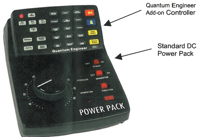
Quantum Engineer Shown Attached to Standard DC Power Pack

The QARC controller, called Quantum Engineer, can be added to your existing Analog DC power pack in less than five minutes. Wiring is simple: two wires go the variable DC output from the power pack and two wires go to the track. All features on the power pack remain the same including throttle and reverse switch control. See our web site at http://www.qsindustries.com/ for further information.